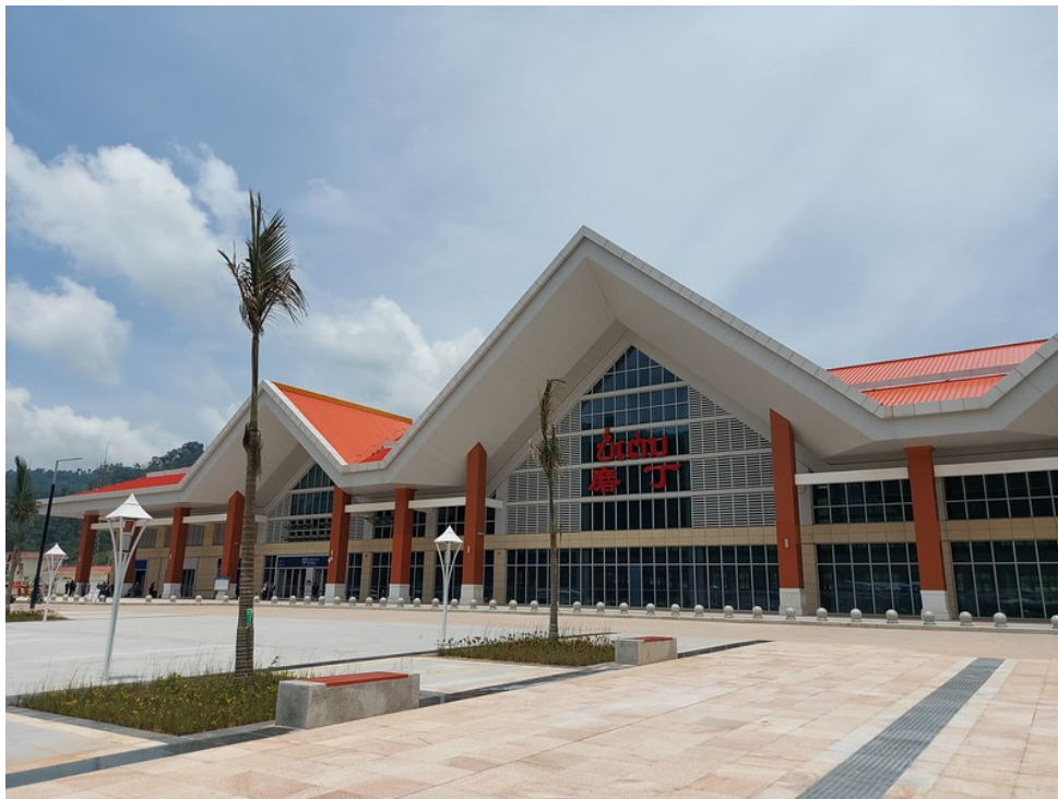
[Boten Railway Station.]

Boten's fortunes were revived in 2015 with the signing of the Mohan-Boten Economic Cooperation Zone. This preceded the start of the construction of the Laos-China Railway , which began in December 2016. The railway construction was completed in December 2021, with Boten being one of the main stops on the line to Vientiane.