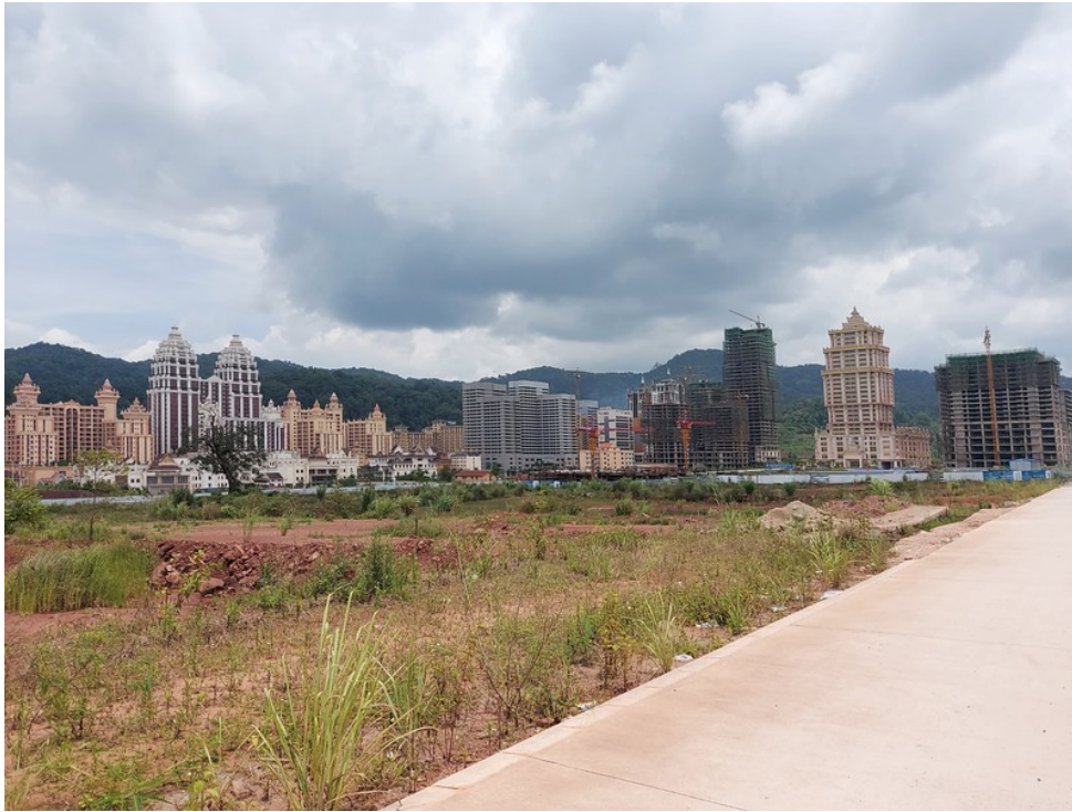
[Boten in May 2022.]